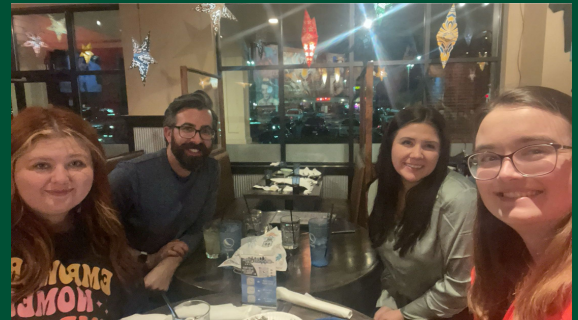
ELSO won 2nd place at Que Onda Tacos Trivia!

Join ELSO for: Educational Support Leadership Opportunities Socialization