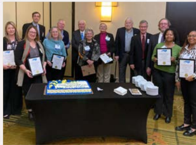
Celebrating 50 years of NCARE by honoring past presidents