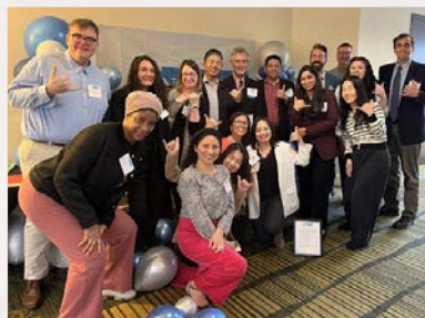
UNC Charlotte faculty, students, and alumni. Go Niners!