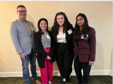
Faculty and students took a photo opportunity after the last session of the conference